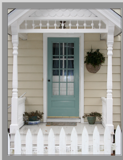
The Home Office

"I am committed to doing a good job for my clients and will work hand in hand with you to develop and deliver quality products—just the way you want them, on time, and within your budget."